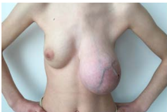
FIGURE 1. Preoperative view