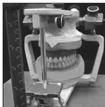
Fig. 2: Maxillary and mandibular denture assembled as per ASA