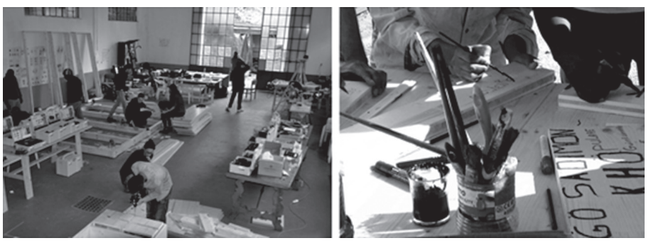
Figure 1a. Figure 1b.