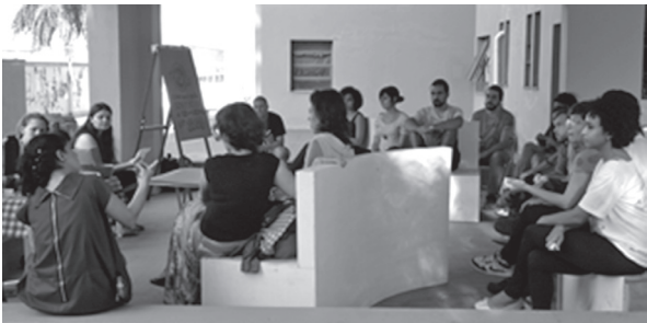
Figure 3a and 3b. Laboratory of Design, Co-creation and Sustainability.