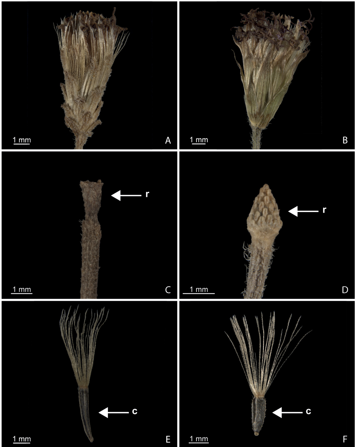
Fig. 1. Characters of taxonomic importance for Praxelinae in Paraguay. Chromolaena : A , cylindrical involucre with imbricated phyllaries. C , flat to slightly convex receptacle. E , obovate cypselae. Praxelis : B , campanulate involucre with subimbricated phyllaries. D , conical receptacle. F , obovate cypselae. Abbreviations: r , receptacle; c , cypselae. Color version at http://www.ojs.darwin.edu.ar/index.php/darwiniana/article/view/1077/1287