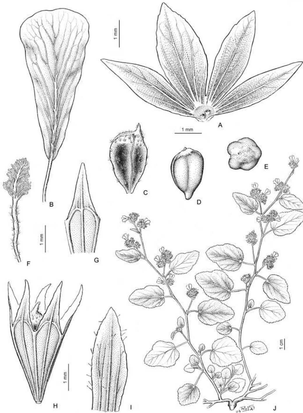
Fig. 2.- Waltheria procumbens . A: bracts, adaxial face. B: petal lamina and claw, adaxial face. C: capsule, lateral view, with darker seed visible. D: seed, lateral view. E: seed, apical view. F: style and stigma of pin flower, a few stigmatic branches removed in front. G: upper calyx tube and lobe, one segment, without hairs drawn, adaxial surface. H: fruiting calyx without hairs drawn, and capsule apex. I: stipule, abaxial view, with only gland-tipped hairs drawn. J: flowering branch, prostrate, petals closed. Drawn by Francisco Rojas. A-J, from Hassler 7842 (G).