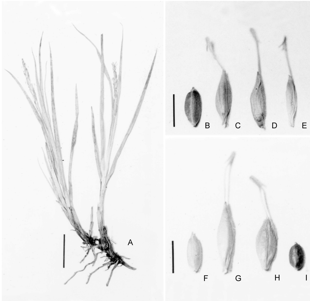
Fig. 1.- A-G: Uncinia austroamericana . H-I: U. macrolepis . A: habit, from Biganzoli 739 . B-C: achene (B) and perigynium (C), from Moore 1869 . D: perigynium, from Pisano 5381 . E: perigynium (immature), from Mejland 1615 . F-G: achene (F, unripe) and perigynium (G), from Biganzoli 739 . H-I: perigynium (H) and achene (I), from Ambrosetti & Méndez s.n., T.B.P.A.-FIT. 4155 . Bars: A = 2 cm; B-I = 3 mm.

general, longer and narrower than those of grassland plants; additionally, the perigynia of the former are smooth except sometimes sparingly hispidulous just beneath the beak, whereas those of the latter are distinctly appressed hispid above the middle of the perigynium. It is also noteworthy that bog plants have more or less loosely-flowered spikes that frequently exceed 2 cm in length, whereas grassland plants have tightly-flowered spikes 2 cm long or less. Indeed, during the course of this study, all examined macrolepis -like plants that possessed spikes longer than 2 cm were assignable to the new species. Issued as a caveat,