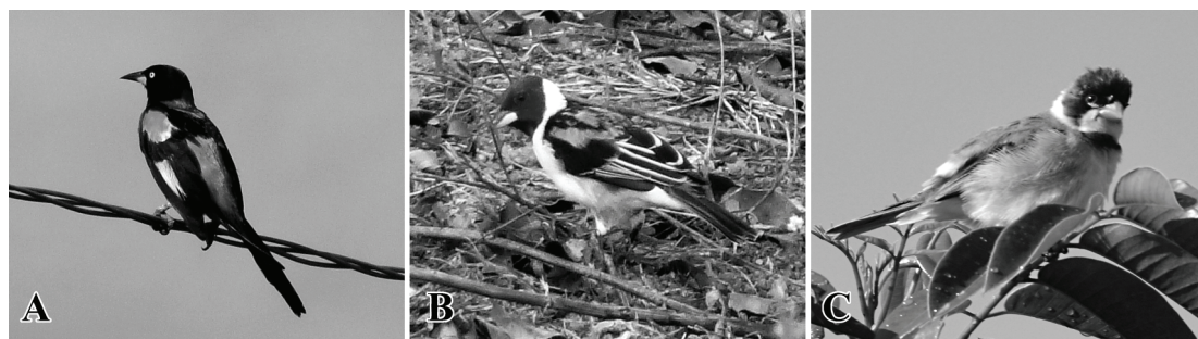
Figure 3. Wild bird species endemic to Brazil with the highest use value as pets in the semiarid region of Rio Grande do Norte state, northeastern Brazil. A: Icterus jamaicaii , B: Paroaria dominicana , C: Sporophila albogularis .

The use values of the species ranged from 0.03–0.61 (Table 1). The highest values correspond to Sporophila albogularis , Paroaria dominicana and Icterus jamaicaii (Fig. 3). According to the respondents, the song and the beauty of the plumage are the main reasons for breed-