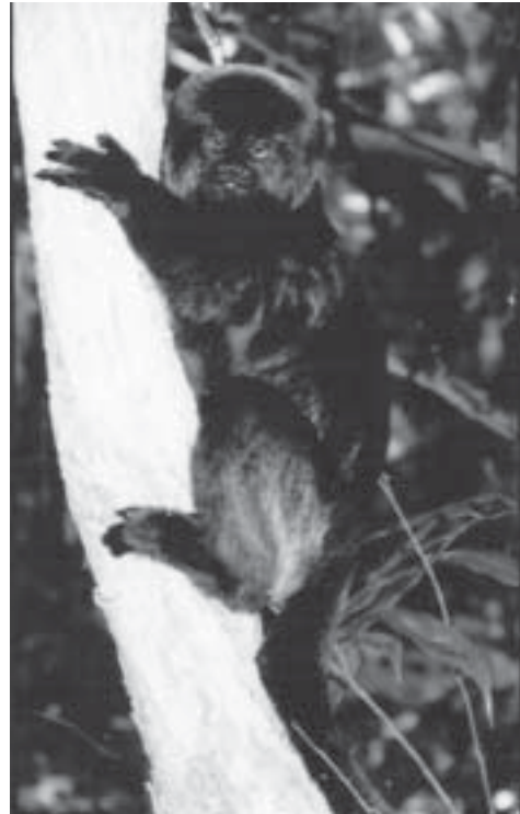
Fig. 2. Adult male Goeldi's marmoset ( Callimico goeldii ) helper. Photo taken at San Sebastian, Bolivia by © Edilio Nascimento B.