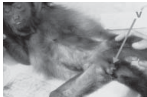
Fig. 4. Anesthetized adult female mantled howling monkey ( Alouatta palliata mexicana ) showing genital hypertrophy (arrow).

Deception may be employed by parasites as a social tool to effect phenotypic manipulation. Although students of animal, including human, communication continue to debate the extent to which signals are reliable ("honest"), there seems to be general agreement that deception may occur where its benefits (to inclusive fitness) outweigh its costs (Otte, 1975; Bradbury and Vehrencamp, 1998; Royle et al., 2002). Importantly, recent theoretical and empirical treatments (Reeve 2000; Stevens and Stephens, 2002; Stevens, 2004) stress "the selfish nature of generosity" (Stevens and Stephens, 2002), providing an alternative interpretation of sharing and cooperation based upon self-interest (also see Johnstone and Bshary, 2002). Like foraging common cranes, Grus grus , the primates studied by Stevens and his colleagues may be sharing to prevent "intraspecific kleptoparasitism" (Bautista et al., 1998). Variations of these interpretations might be applied to numerous observations of osten-