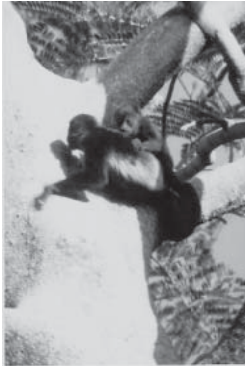
Fig. 1. Juvenile mantled howler monkey ( Alouatta palliata ) carrying unrelated conspecific infant across a space between trees impassable to the infant. Distress vocalizations emitted by the infant may have functioned to induce the juvenile's helping behavior.

At the other extreme, some callitrichids are cooperative breeders, and mothers receive assistance from putative fathers and other group members who are often infants' older siblings (Mitani and Watts, 1997; Porter, 2001; Saltzman, 2003). Porter (2001) reports that the reproductive output of female Goeldi's marmosets ( Callimico goeldii ; Fig. 2 ) is increased by assistance from other group members as well as the presence of biannual birth seasons.