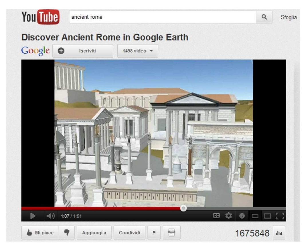
Figure 3. Channel ANCIENT ROME on Youtube realized with 3D virtual reconstruction on Google Earth.

Using Google Earth you can create 3D virtual tours and virtual three-dimensional reconstructions of architectural sites, urban centers, touristic sites, cultural sites, landscapes, etc. In November 2008, ANCIENT ROME opens on Youtube (<a href="http://www.youtube.com/watch?v=MqMXIRwQniA">http://www.youtube.com/watch?v=MqMXIRwQniA</a>). This channel, born through a collaboration between YouTube, Rai.tv and Past Perfect Productions, will show several documentaries about the eternal city (Figure 3), with the obvious purpose of finding new and inventive ways to give students the opportunity, today as well as tomorrow, to continue studying Roman history and Roman buildings. In 2009, this project became part of Google Earth software, with a documentary including the 3D virtual reconstruction of the city, navigable, that restores the image of how the city presented itself in 320 AD.