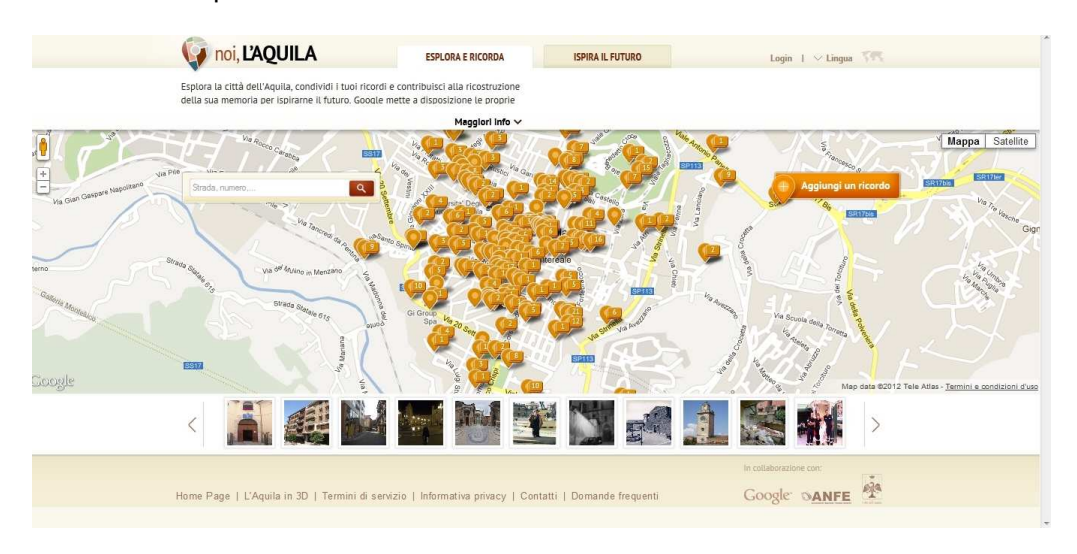
Figure 6. UGC signed in the map of L'Aquila's on Google Map.

Google, which has donated the project to the City of L'Aquila and to the ANFE, has provided the city and its inhabitants its technology, facilitating the collection and creation of stories, memories, videos and photos provided and shared by users (Figure 6), for preserving memory of L'Aquila and its significant artistic and cultural heritage through geo-tagged data. This idea, that is a wonderful example of geo-social digital tagging with user generated contents, useful to write "stories on geographies" (Bonacini, 2013), is also a real pilot project that Google intends to make available to all communities of the world affected by natural disasters. Japan, for example, is already among the first countries to have implemented it.