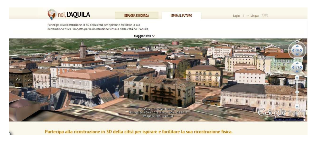
Figure 4. A 3D photo-textures reconstruction of L'Aquila historic center realized with Google SketchUp on Google Earth.

Connected with the project Come Facciamo is the website <u>www.noilaquila.it</u> ("We L'Aquila": Figure 5), a web technology platform, based on Google Map with Street View service, launched in June 2011 for the three-dimensional virtual reconstruction of L'Aquila, whose motto is "Sharing the memory to reconstruct the future". The site is organized and implemented in collaboration with Google, creator of the project, the Community of L'Aquila and the National Association of Families Emigrants (ANFE) that is run by its delegation in L'Aquila.