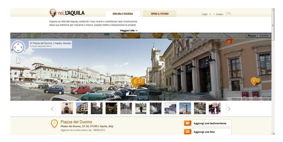
Figure 5. A 360 degrees visualization of the Duomo of L'Aquila with UGC posted on Google Street View.

Google, which has donated the project to the City of L'Aquila and to the ANFE, has provided the city and its inhabitants its technology, facilitating the collection and creation of stories, memories, videos and photos provided and shared by users (Figure 6), for preserving memory of L'Aquila and its significant artistic and cultural heritage through geo-tagged data. This idea, that is a wonderful example of geo-social digital tagging with user generated contents, useful to write "stories on geographies" (Bonacini, 2013), is also a real pilot project that Google intends to make available to all communities of the world affected by natural disasters. Japan, for example, is already among the first countries to have implemented it.