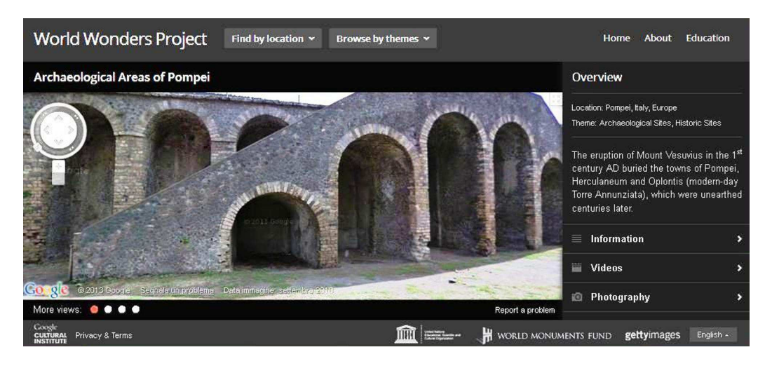
Figure 2. A 360 degrees visualization of the Roman theatre in Pompeii in Google World Wonders Project.

with UNESCO copyright and links to the UNESCO heritage list and to Wikipedia), World Museum Fund and Getty Images database (for images). World Wonders Project collects a lot of information, pictures (with forms of user co-participation), 3D images, texts and videos. This is the latest philanthropic project of Google, focused both on giving visibility to the most beautiful places in 18 different countries in the world and on encouraging people to fight to preserve them. You can find these cultural wonders by geographical locations and browse them by themes. Large is the presence of Italian sites, from Pompeii (Figure 2) to many historic city-centers.