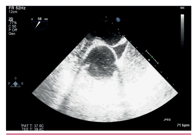
Fig. 2 . Transesophageal echocardiography in a short-axis view at 56 degrees. Opacification of the right atrium and spontaneous right-to-left bubble passage (in dorsal recumbent position) are observed.