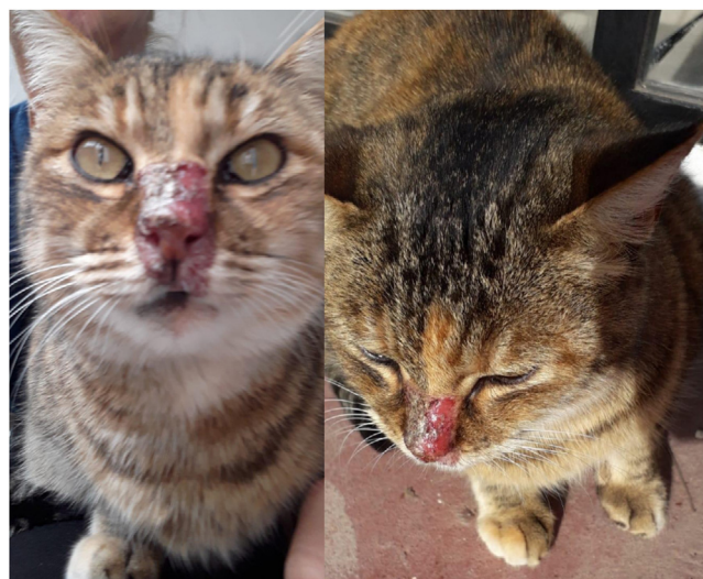
Figure 1 Ulcerative crusted facial lesions in the cat with sporotrichosis.

Samples of the cutaneous exudates collected through sterile swabs from the ulcerative lesions of the cat were also obtained for fungal culture and identification. For this purpose, fungal isolation was performed by spreading the specimens on Sabouraud dextrose agar supplemented with chloramphenicol (SDA) at 25 °C and on brain heart infusion agar (BHI) at 37 °C with daily observation. Microscopic mor-