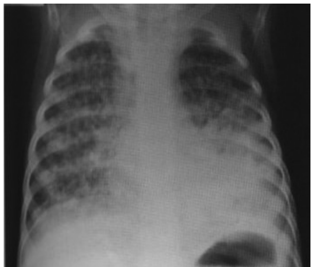
Figure 3. Primary pulmonary TB with hematogenous dissemination (miliary).

Ultrasound is useful for identifying and characterizing lesions in the pleura, chest wall, diaphragm, and mediastinum. Its main advantages include the absence of ionizing radiation, real-time exploration capability, the possibility of conducting the study