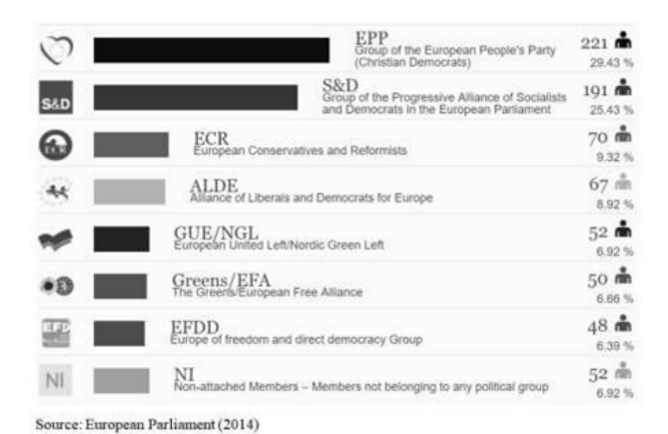
FIGURA 2

Given the chart above, the 2014 European elections headed to a sharp growth in the electoral consensus of parties and independent MEPs marked as eurosceptic. The EPP remained the largest group, with 221 seats. The S&D also remained the second largest, with 191 seats. The ECR performed considerably higher than initial projections (40 seats) and came third, with 70 seats (European Parliament, 2014) (Kirk, 2014). ALDE came fourth, with 67 seats. The radical-left GUE/NGL was fifth, with 52 seats. The Greens/EFA came sixth, with 50 seats. It was just a little higher than the anti-EU EFDD, which occupied 48 seats. Finally, 52 seats were occupied by "non-attached" MEPs (European Parliament, 2014).