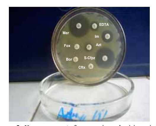
Figure 3 . K. pneumonaie from equine adenitis resistant to Im, Fox, Azt and Cftx.

monodiscs of the carbapenems imipenem (Im, 10 \mu g) and meropenem (Mer, 10 \mu g) with one of ethilendiaminotetraacetic acid (EDTA, 1 \mu mol) acting as MBL inhibitor were used according the agar diffusion method <sup>6</sup>. The test is positive when there is synergism between EDTA and carbapenem discs.