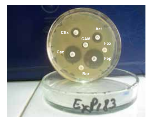
Figure 1 . K. oxytoca from canine piodermitis resistant to Cftx, Azt, CAM and Fox.

The strains were also analysed to phenotypically determine the presence of metallo- \beta -lactamase (MBL):