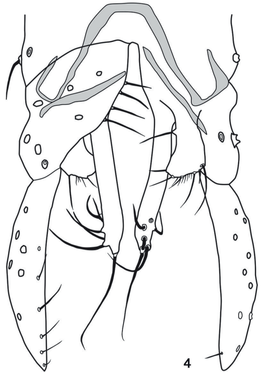
Figs. 1 - 4. Polypedilum (Tripodura) quinquasetosum (Edwards). Male imago. 1, wing; 2, tibial scale of fore leg; 3, hypopygium, dorsal view; 4, hypopygium with tergite IX removed, right, dorsal view, left, ventral view. Scale bar= 100 \mu m, except in Fig. 2.